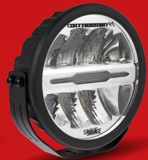
OPTIBEAM SAVAGE 9" Amber / white. Chrome frame included.