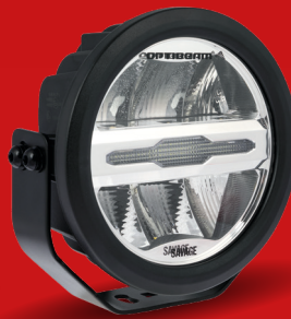
OPTIBEAM SAVAGE 7" Amber / white. Chrome frame included.