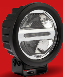
OPTIBEAM SAVAGE 5" White parking light. Chrome frame included.

The versatile innovative series of auxiliary lights is suitable for both professional heavy traffic and normal car use.